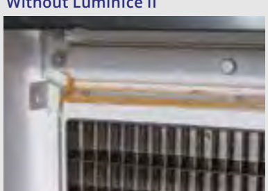
The LuminIce II device runs quietly 24 hours a day keeping your ice machine cleaner and helping to relieve the stress and pain of frequent cleanings due to challenging foodservice environments where yeast, flour, and other contaminants create an environment favorable to growth. Reduced cleanings ultimately saves labor time, cost, and machine downtime during the cleaning process.